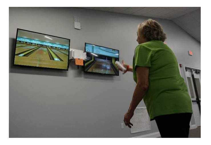
Thank you to <u>everyone</u> who participated and helped throughout the tournament. We had a blast. Look forward to the next one.