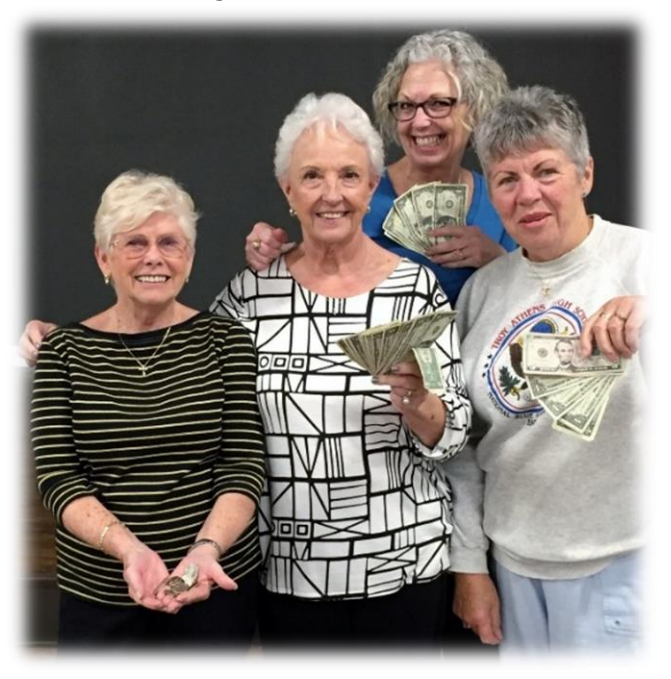
February 11<sup>th</sup> Bunko Winners!!