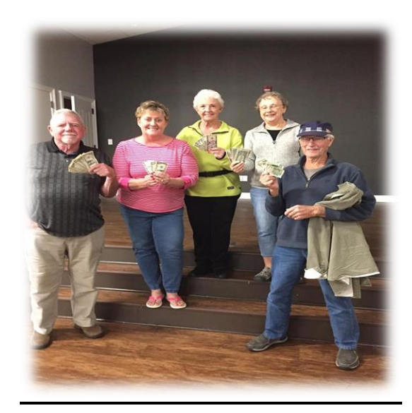
InitiaJoin the fun the 1st and 3rd Tuesday's at6:30.